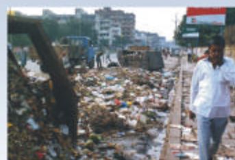
50% of Waste remains uncollected in the cities...