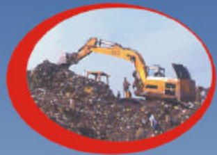
SOLID WASTE DISPOSAL PROBLEM