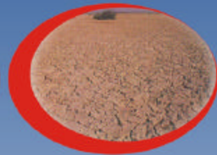
ORGANIC MATTER DEPLETION IN THE SOIL OF BANGLADESH