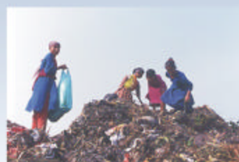
Waste Pickers looking for recyclables even in the Dumpsites....

ENERGY ADDRESS House - 21b Road - 7 Block - 8 House (model town) Dhaka - 1213 Bangladesh