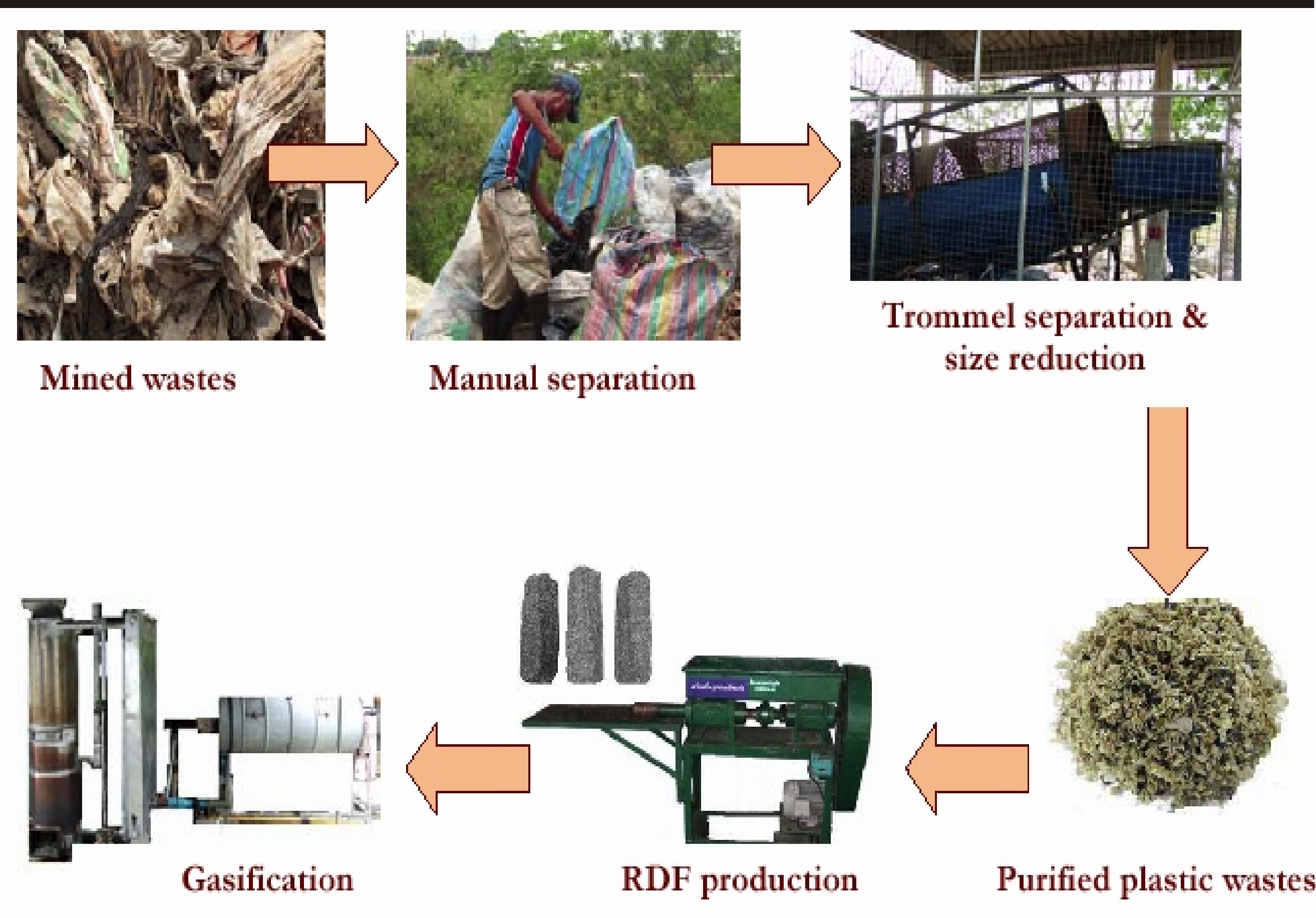
Process of RDF Production, Nonthaburi, Thailand